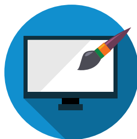
Graphics & Designing