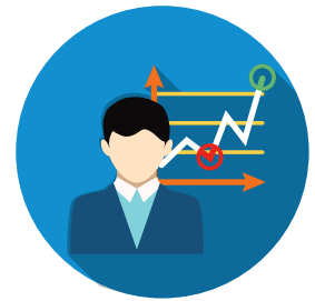
Business Productivity & Management

Comprehensive Business Management Suite (CBMS)